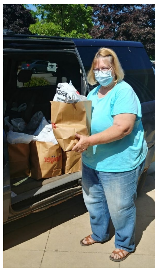
Disability Network West Michigan, Muskegon, MI

Noteworthy, especially during the pandemic, is that FTA's Section 5310 program allows grantees to coordinate and assist in regularly providing meal delivery service for individuals who are homebound, if the delivery service does not conflict with providing public transportation service or reduce service to public transportation passengers. The Area Agency on