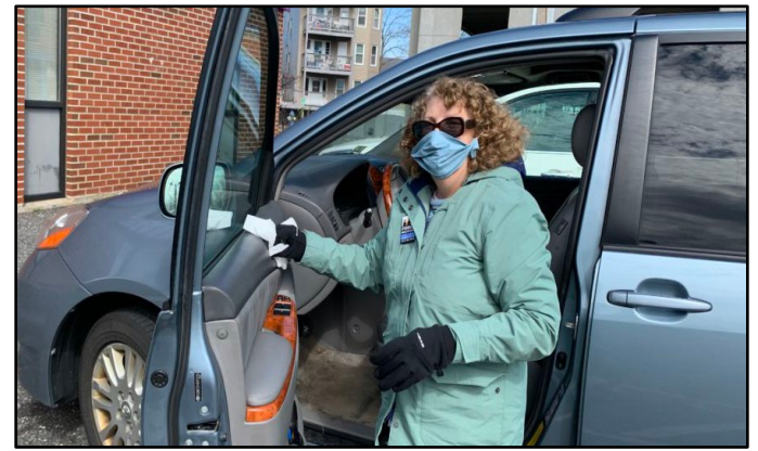
Jewish Family Service of Metrowest, Framingham, MA