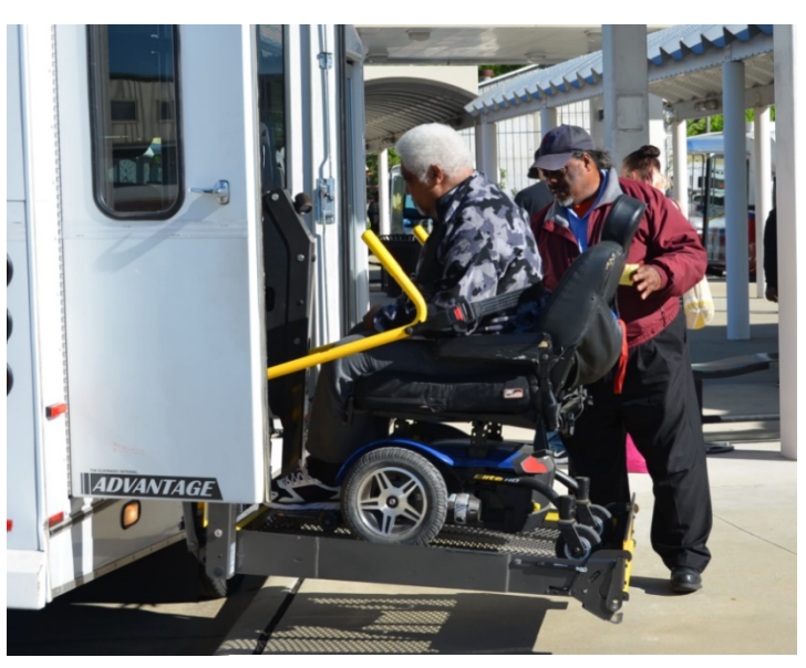
Texarkana Urban Transit District, Texas

published by the Administration for Community Living (ACL) and Administration on Aging (AOA), nearly 1 in 3 older Americans and nearly half of women age 75 and over live alone -- many without access to reliable transportation. Social isolation can also contribute significantly to loneliness among older citizens, putting this population at a significant health risk. Recent research has shown that loneliness can be as damaging to health as smoking 15 cigarettes daily.