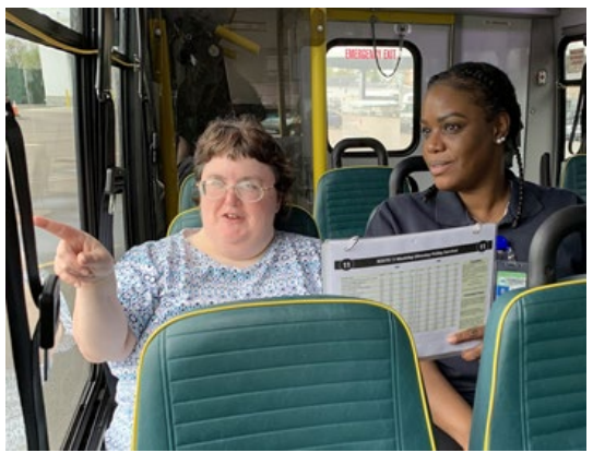
MetroWest Regional Transit Authority, Framingham, MA

In addition, people with I/DD also face systemic barriers to transportation which limit their options. Individuals with I/DD often rely on Medicaid nonemergency transportation as their only alternative to rides provided by family, friends and/or caregivers. Medicaid Home and Community-Based Services 1915(c) Waivers is the largest provider of long-term services and supports for people with IDD. Medicaid provides many in the I/DD community with non-emergency medical transportation but does not require transportation related to other aspects necessary for community