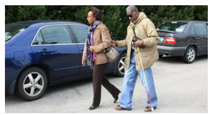
The Center for Volunteer Caregiving, Cary, NC

To address the need for reliable and expanded transportation solutions in lowa, the Transportation Improvement Program began to form partnerships between the American Cancer Society, the <u>lowa Cancer Consortium</u>, and public transit agencies in 2019. The <u>American</u> <u>Cancer Society Road to Recovery</u> program is a network of volunteers who provide free rides for cancer patients to medical appointments and procedures.