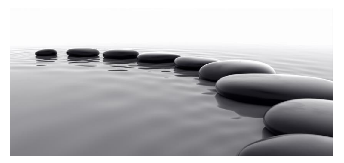
*The SCAN Foundation - advancing a coordinated and easily navigated system of high-quality services for older adults that preserve dignity and independence. For more information, visit www.TheSCANFoundation.org.

This brief was prepared, in partnership with N3C, by Collaborative Consulting with support from The SCAN Foundation.*