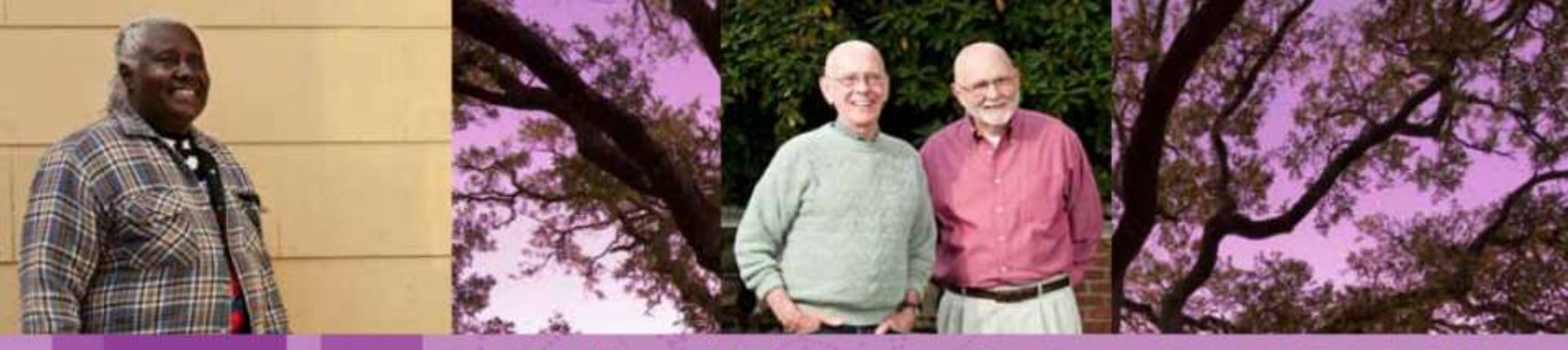
National Resource Center ON LGBT AGING

The National Resource Center on LGBT Aging is the country's first and only technical assistance resource center aimed at improving the quality of services and supports offered to lesbian, gay, bisexual, and transgender (LGBT) older adults.