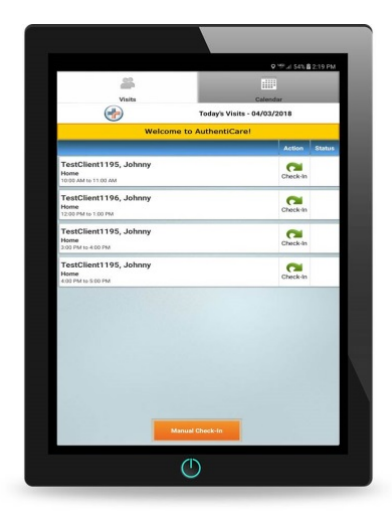
Mobile App w/GPS Tracking