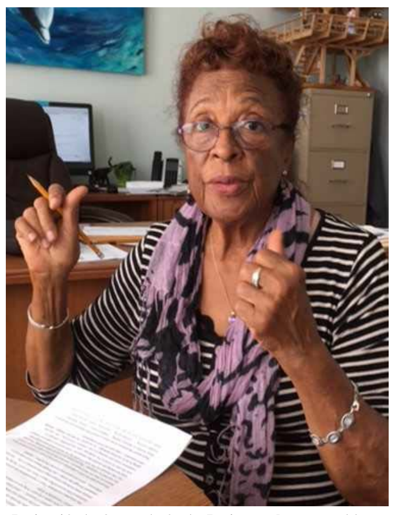
Employed Senior Community Service Employment Program participant.

The ETA budget for FY 2018 proposes drastic cuts to both WIOA and SCSEP compared with FY 2017 funding levels. WIOA's proposed funding for FY 2018 is 2.05 billion, or a 62 percent cut from 2017. Following the Great Recession, SCSEP's funding peaked in FY 2010 at $825 million and has been cut by 50 percent over the past seven years. In FY 2017, SCSEP received $400 million, or a $34 million (8.5 percent) cut from FY 2016 funding levels. According to a recent evaluation, the PY 2011 funding of approximately $450 million is insufficient to cover even 1 percent of eligible participants (Kogan et al. 2013). For FY 2018, the ETA budget eliminates all funding for SCSEP, claiming that "the goal of supporting the self-sufficiency and employment of older workers can continue to be addressed through the core WIOA programs" (DOL 2017).